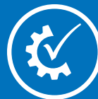
Management System Certification