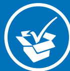
Product & Service Certification